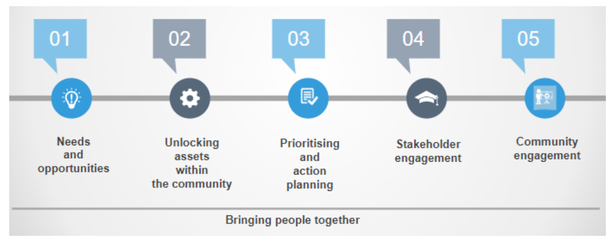
Figure 1. Subjects addressed during the local workshops

During August - November 2019, 64 people from rural communities in Estonia, Finland, Scotland and Romania participated in local workshops focused on "Methods of community activation and participation in rural areas" divided into five subjects of analysis (figure 1), to stimulate the development of social enterprises in their communities.