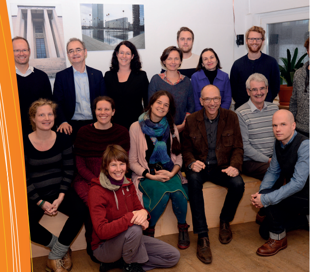
Our project and teaching team from 4 countries