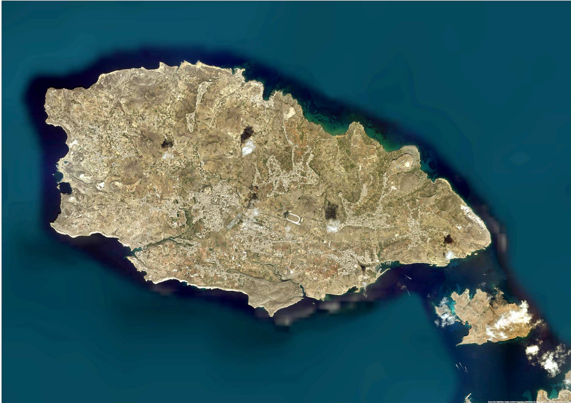
Gozo Orthophoto , unscaled

LE:NOTRE Institute Linking landscape education, research and innovative practice