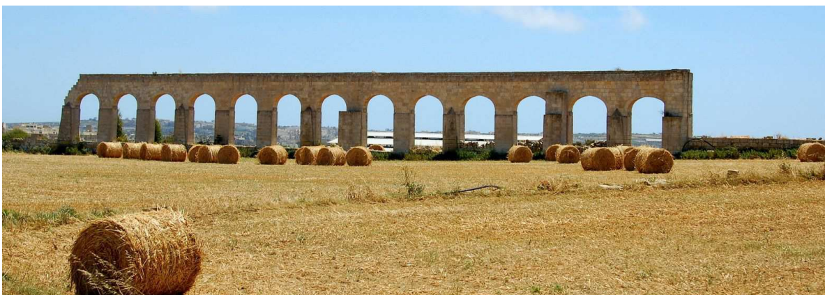
Gozo Aqueduct , Photo by James Stringer

The scope of this competition is the entire island of Gozo. The participating teams are invited to envision a scenario of the islands' potential landscape status in 2050. Gozo measures 14 km from west to east and 7,25 km from north to south. The topographical map shown here is unscaled. Original scaled topographic maps, thematic maps, GIS data and secondary materials can be retrieved after registration. Registered participants will receive access to the competition online repository.