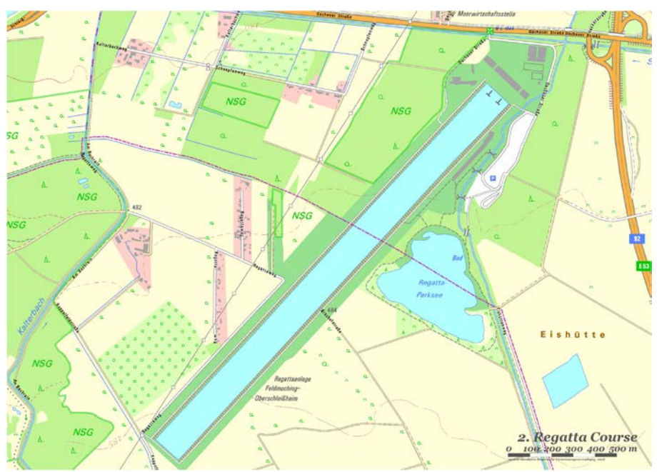
Fig. 3: Focus area 2: Olympic rowing regatta course