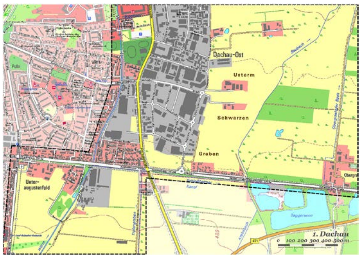
Fig. 2: Focus area 1: Eastern city edge and entrance of Dachau