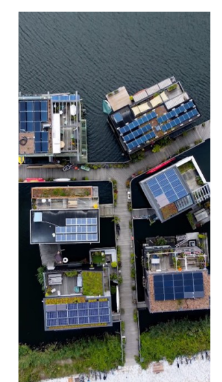
Solar PV rooftops on the houseboats, Source: Space&Matter

Schoonship is designed to be energy self-sufficient, producing enough to meet or exceed its collective demand. This floating district exemplifies how urban development can be energy-positive, environmentally responsible, and community-driven, thereby establishing a new standard for sustainable neighborhoods in urban areas worldwide. Furthermore, the integration of nature-based solutions serves to reinforce the neighbourhood's resilience, biodiversity, and environmental benefits. The utilisation of blockchain-based energy sharing establishes Schoonschip as a paradigm for community-centric, pioneering energy solutions.