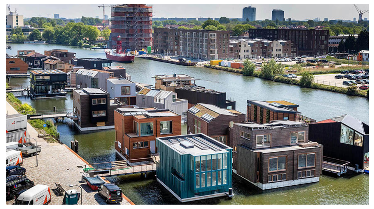
Schoonship overview