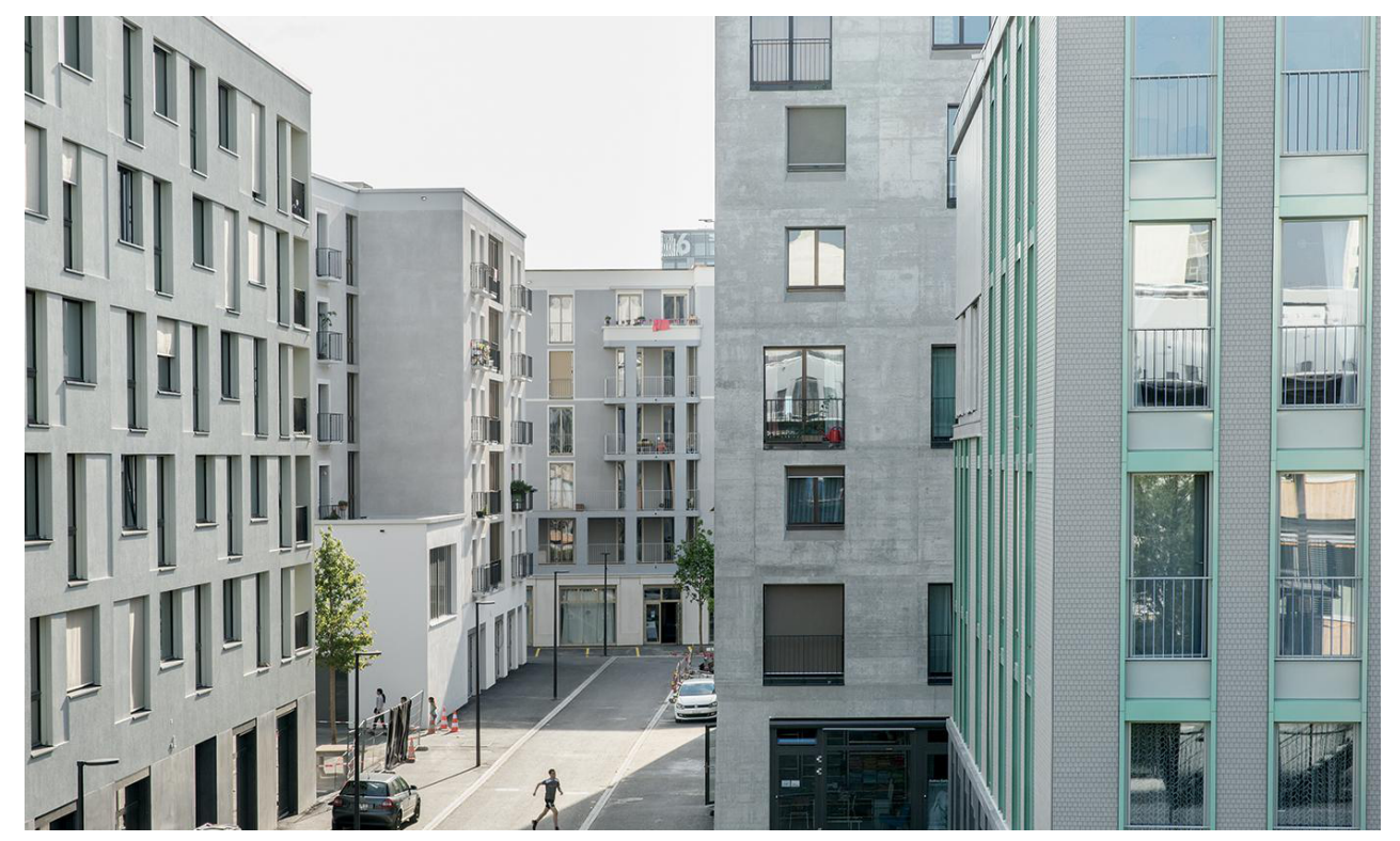
Hunzikerareal, from left to right, buildings by: Müller Sigrist, Duplex Architekten, Miroslav Šik, Pool Architekten (last two buildings on the right).

The Hunziker Areal project exemplifies the integration of energy-efficient design, renewable energy production, and nature-based solutions into a dense urban environment, thereby achieving Positive Energy District (PED) status. The project is designed to produce renewable energy on annual basis of about 1,180 to 1,680 MWh (solar PV and heat pump production combined). By generating surplus energy through renewable sources, Hunziker Areal not only meets its energy demands but also contributes to Zürich's objective of reducing city-wide carbon emissions. The cooperative model encourages community engagement, while the integration of nature-based solutions enhances biodiversity and environmental resilience, thereby establishing Hunziker Areal as a model for future sustainable urban developments.