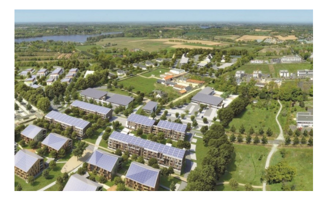
District of La Fleuriaye, Carquefou in France

The objective of this project is to achieve a positive energy balance, whereby the generated energy exceeds the consumed energy, through the utilisation of renewable resources, innovative technology and natural solutions. By prioritising environmental objectives and improving the quality of life for residents, La Fleuriaye provides an exemplar for future urban developments.