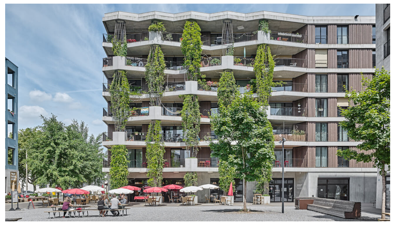
Haus E at Hunziker Square by Müller Sigrist Architects