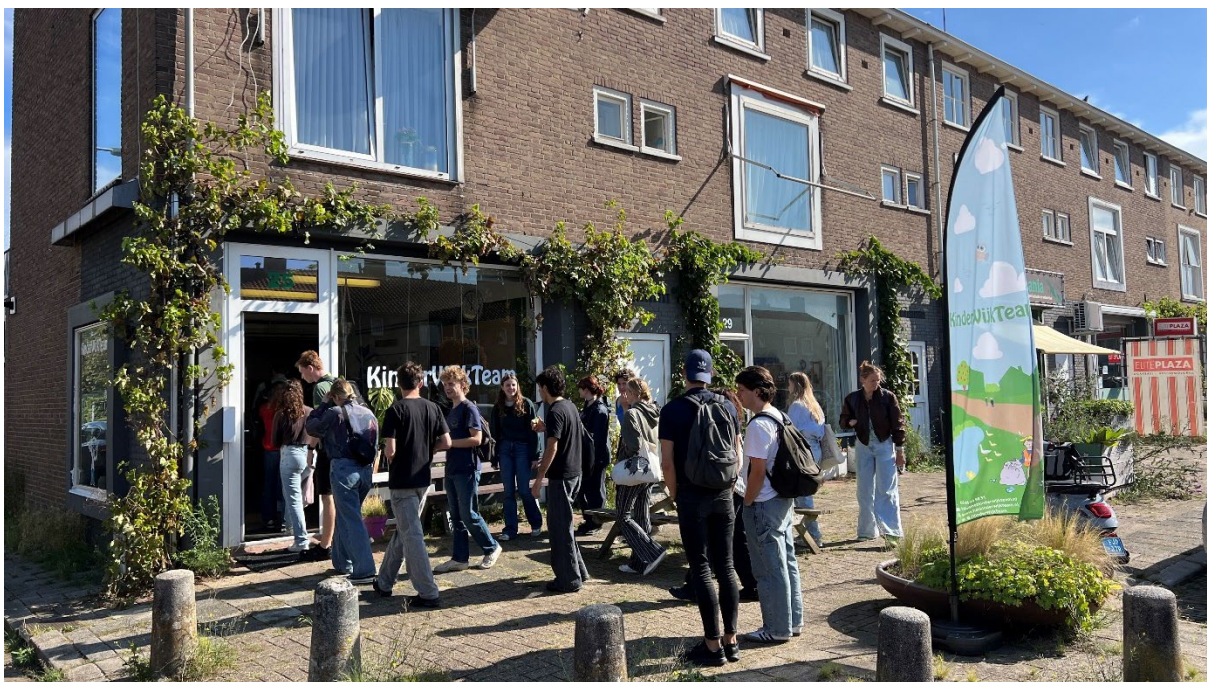
Figure 1 Office, workplace and garden of The Kinderwijkteam in Malburgen.

Volkshuisvesting is a large Social Housing Company in Arnhem, established in 1908: Home | Volkshuisvesting Website . The Kinderwijkteam is the commissioner and project leader. The “Childrens neighborhood team” is a social enterprise that aims at giving a better life to children through activities and projects in the local neighborhoods: Home | Het KinderWijkTeam .