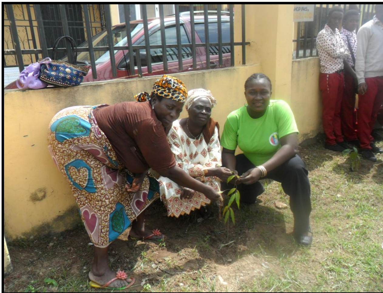
IRE- AKARI MARKET EXECUTIVE PLANTS A TREE.