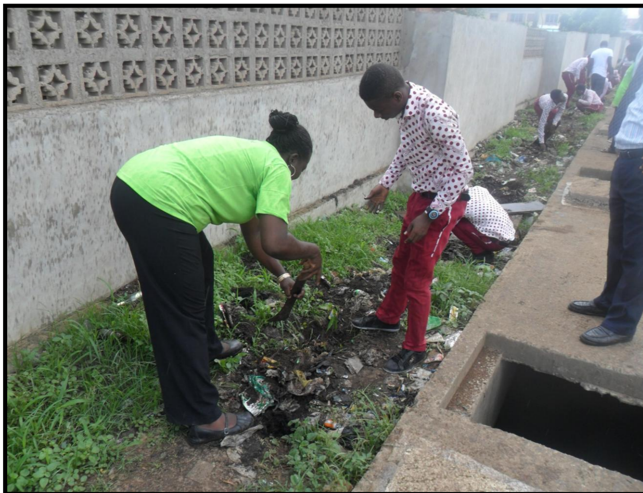
STUDENTS PLANTING TREES ALONGSIDE ENVIRONMENT AMBASSADOR