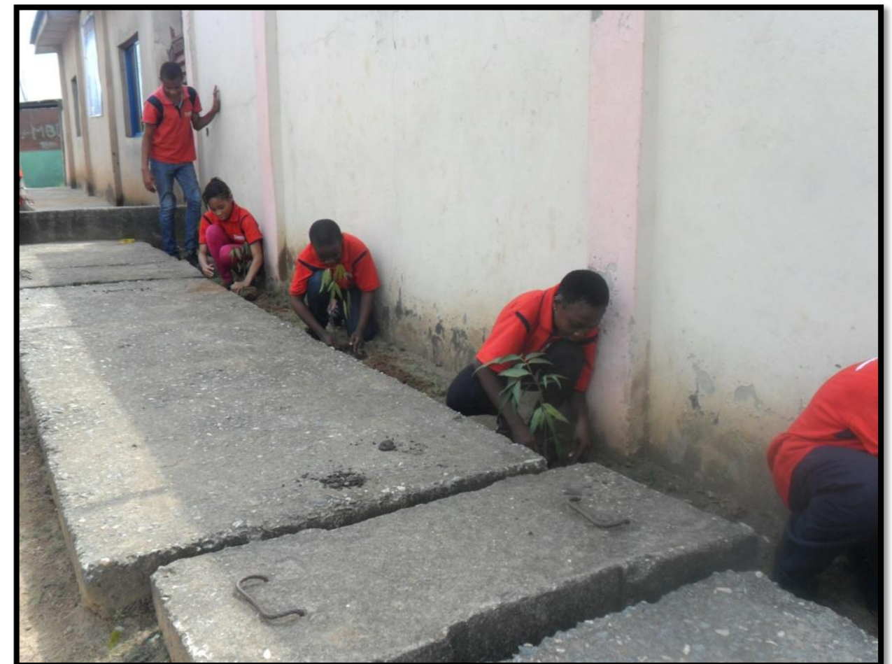
STUDENT S PLANTING TREES.