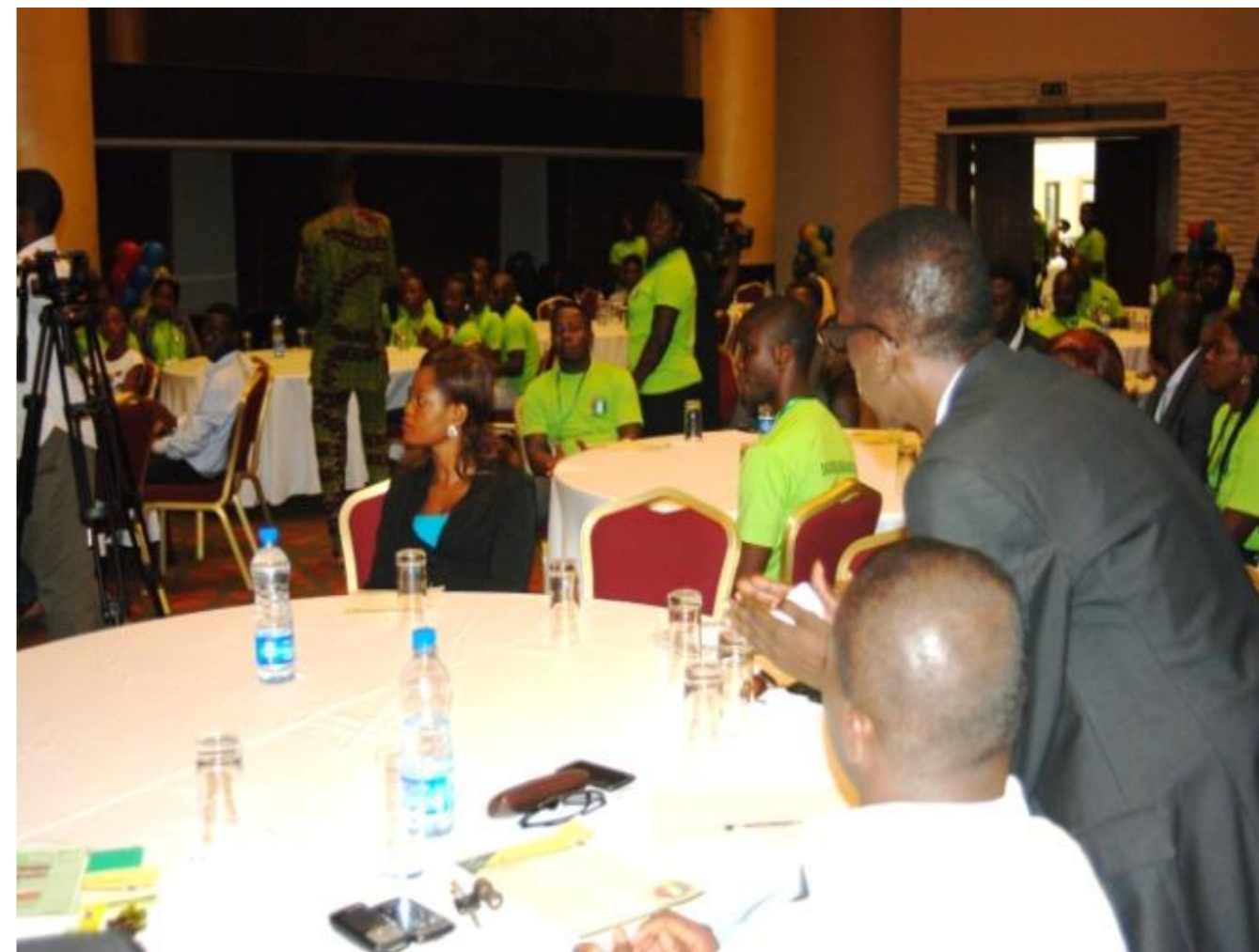
Participants at the Campaign launch event.