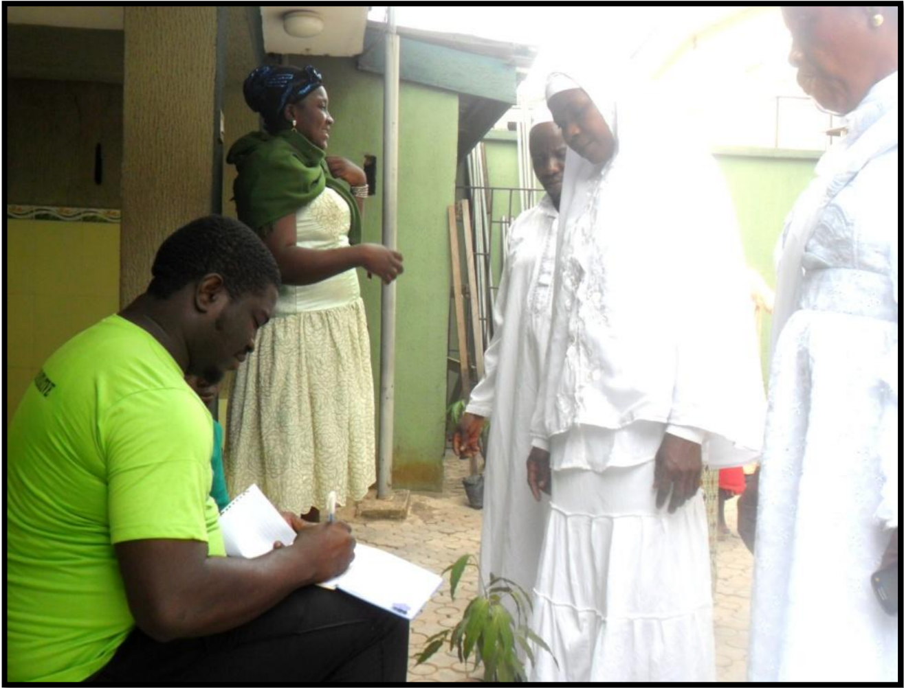
CONGREGANTS REGISTER THEIR NAMES AND PICK A TREE SEEDLING.