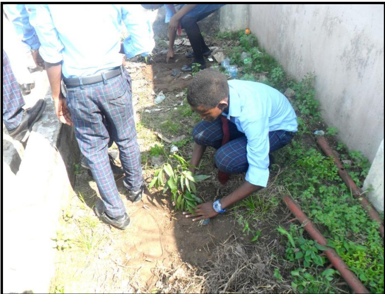
STUDENT BEGINS TO PLANT A TREE

After the Environment seminars were held in the private High schools, an Environment Club was inaugurated and Tree planting project commissioned as the club's first project.