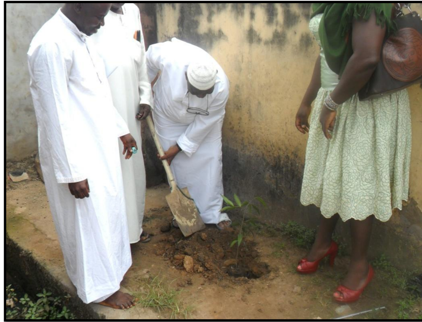
VICE CHAIRMAN, SECRETARY OF THE ANSARUDEEN SOCIETY, OKOTA CHAPTER AS THEY CONDUCT CEREMONIAL TREE PLANTING ALONGSIDE THE ENVIRONMENT AMBASSADOR ON THE STREET WHERE ANSARU-DEEN CENTRAL MOSQUE, OKOTA IS LOCATED.