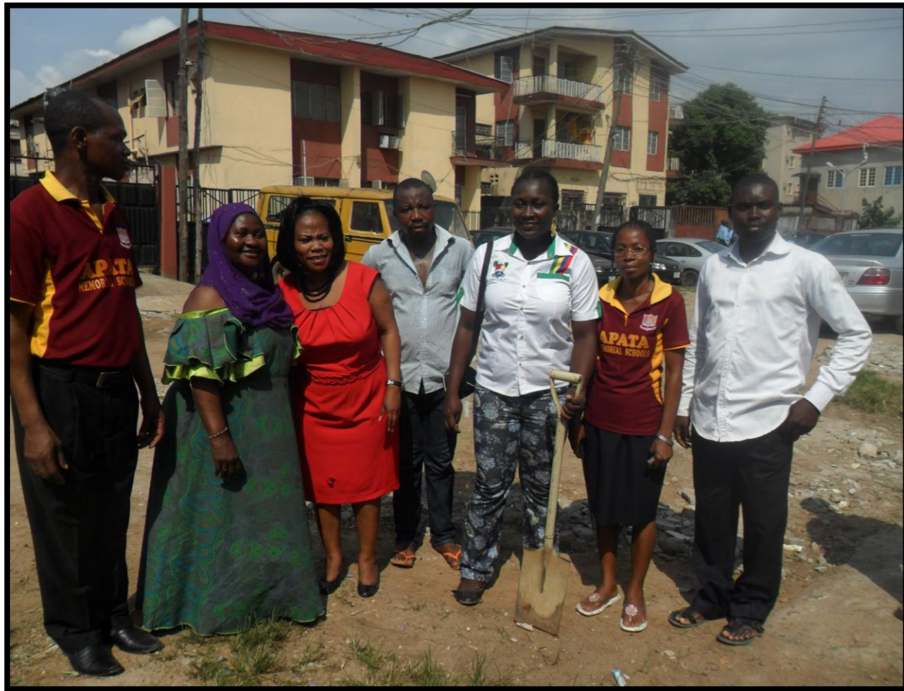
PICTURES WITH RESIDENTS, SCHOOL PRINCIPAL, EXECUTIVE DIRECTOR AND ENVIRONMENT AMBASSADOR.