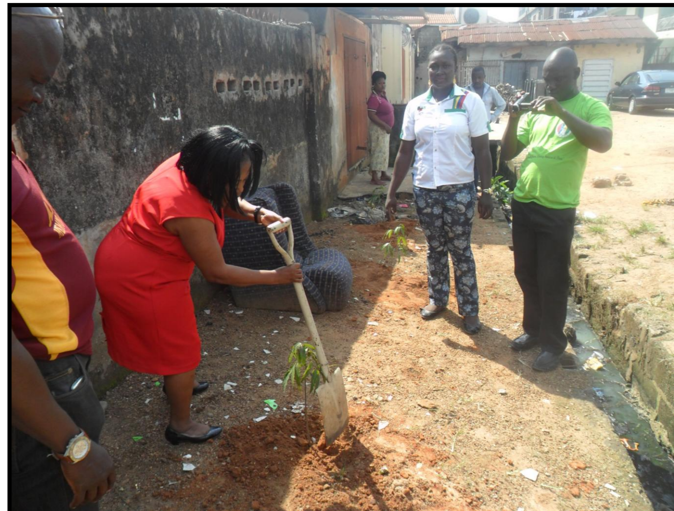
SCHOOL EXECUTIVE DIRECTOR PLANTS A TREE.