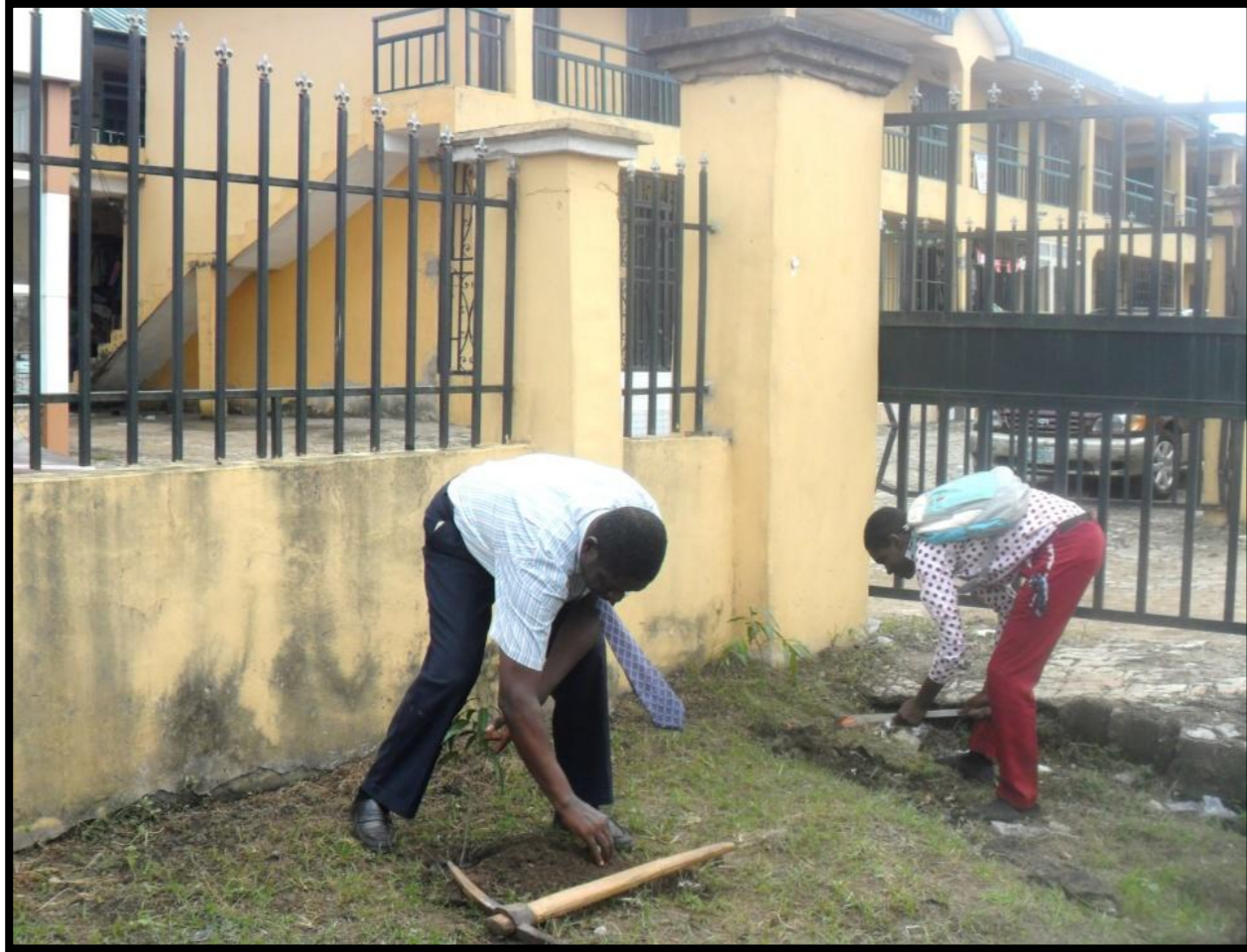
SCHOOL PRINCIPAL PLANTING A TREE.