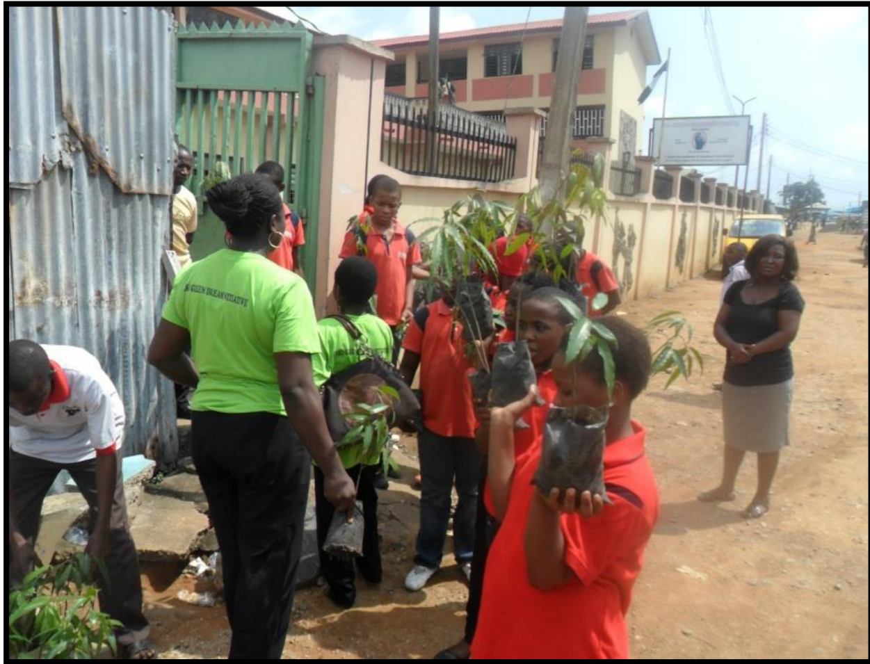
ARRIVAL AT THE SCHOOL, TREE SEEDLINGS GIVEN TO ENVIRONMENT CLUB.