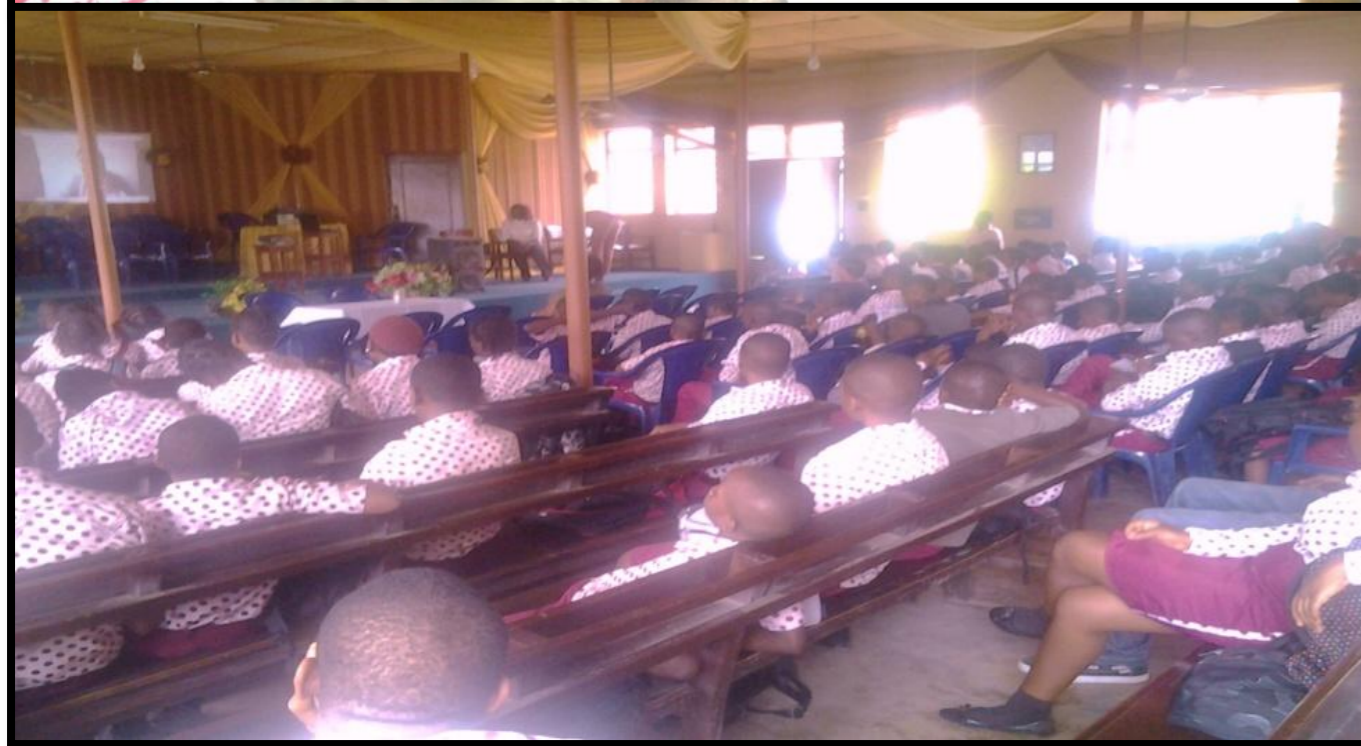
ENVIRONMENT SEMINAR AT GIDEON INTERNATIONALHIGH SCHOOL, OKOTA, 8 TH October, 2013