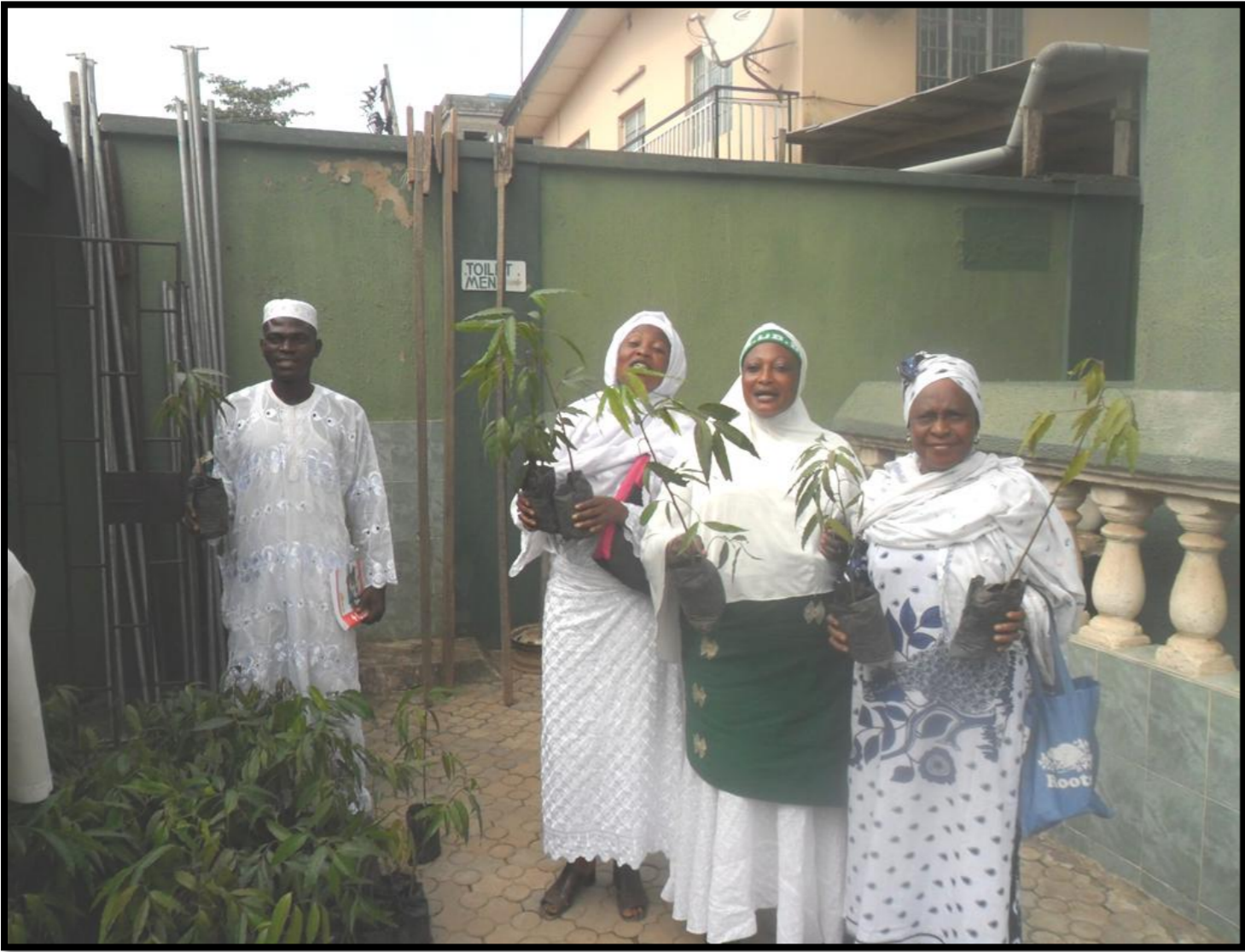
REGISTERED CONGREGANTS WITH THEIR TREE SEEDLING.