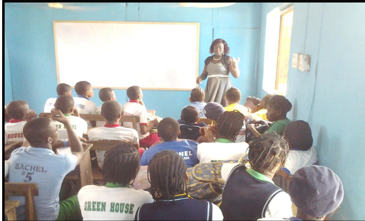
ENVIRONMENT SEMINAR AT BACHEL ACADEMY, CELE-EGBE, LAGOS. 1 ST NOVEMBER, 2013