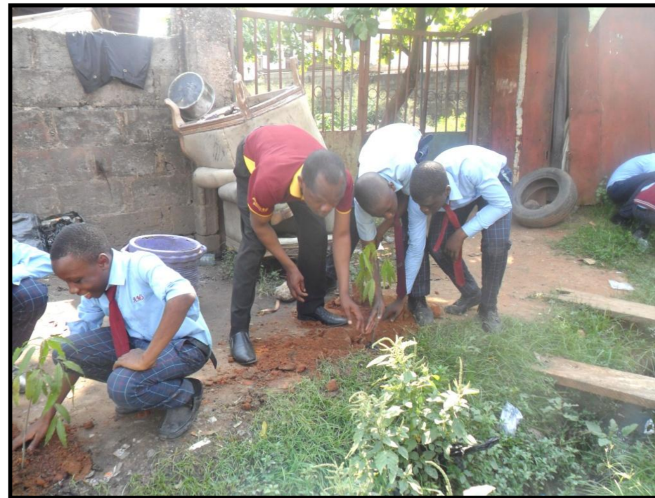
SCHOOL PRINCIPAL PLANTS A TREE ALONGSIDE STUDENTS