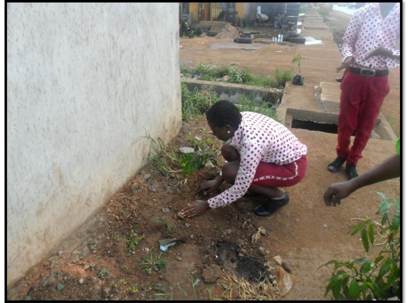
STUDENT PLANTS A TREE.