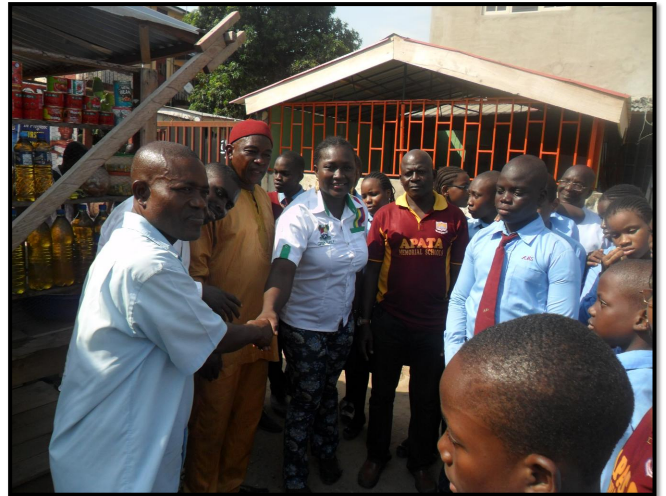
C.D.A EXECUTIVE PROMISE TO TEND AND KEEP TREES PLANTED