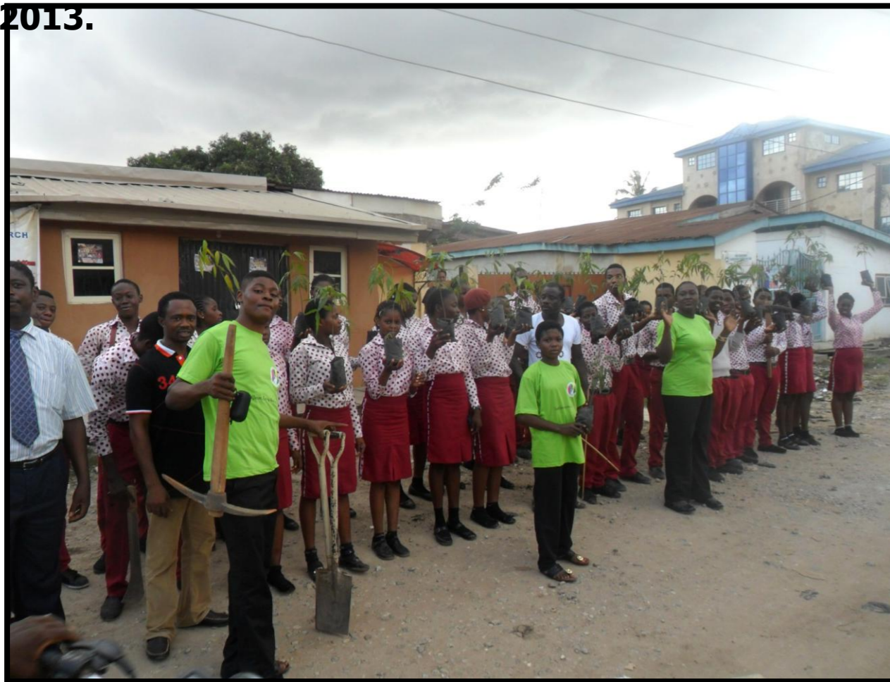
ARRIVAL AT THE SCHOOL, TREE SEEDLINGS GIVEN TO ENVIRONMENT CLUB