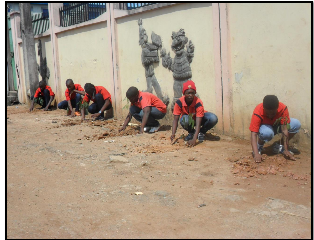
STUDENT S PLANTING TREES.