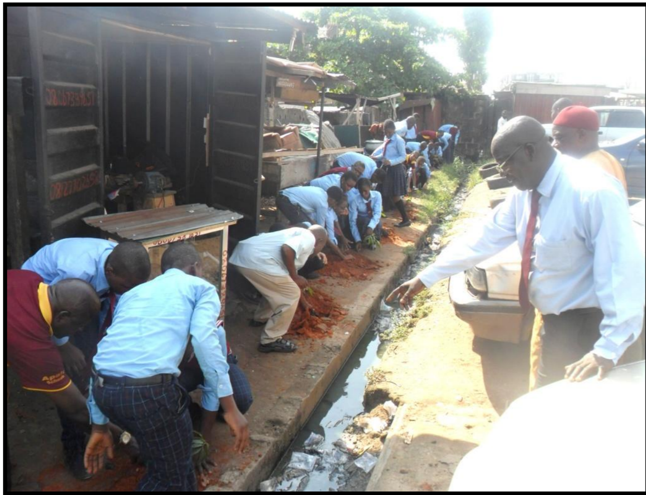
STUDENTS PLANTING TREES