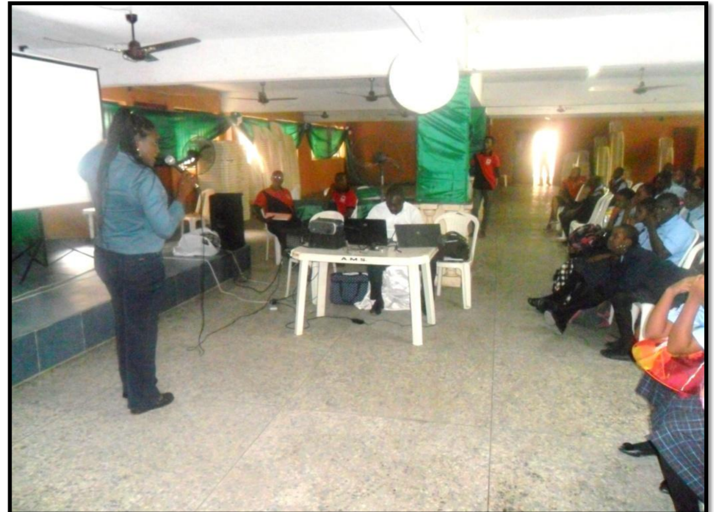
ENVIRONMENT SEMINAR AT APATA MEMORIAL HIGH SCHOOL, OKOTA, 2 nd October, 2013