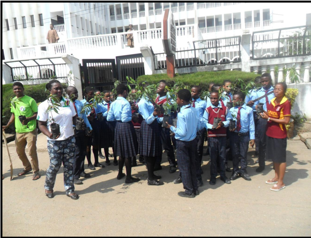
ARRIVAL AT THE SCHOOL, TREE SEEDLINGS GIVEN TO ENVIRONMENT CLUB