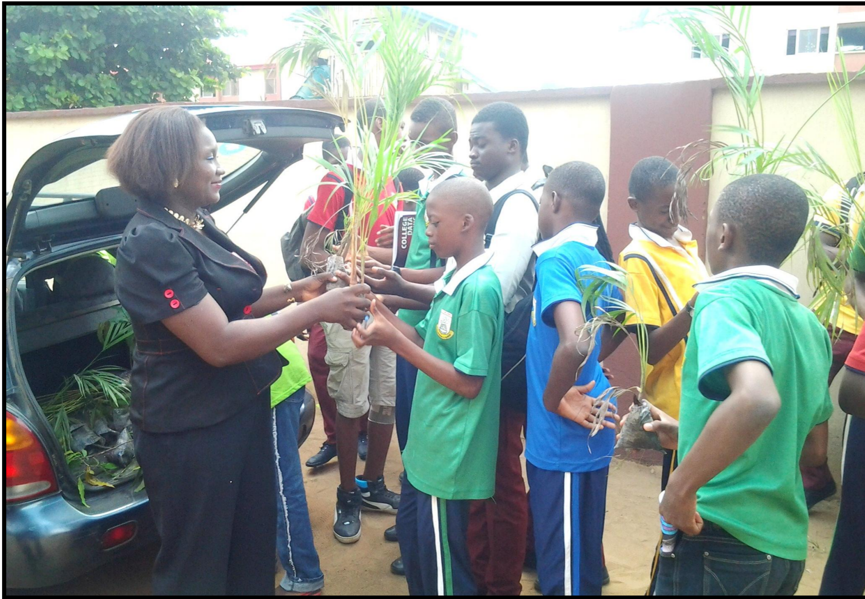
ARRIVAL AT THE SCHOOL, TREE SEEDLINGS GIVEN TO ENVIRONMENT CLUB OF EFFORTSWILL ACADEMY, EJIGBO, LAGOS.