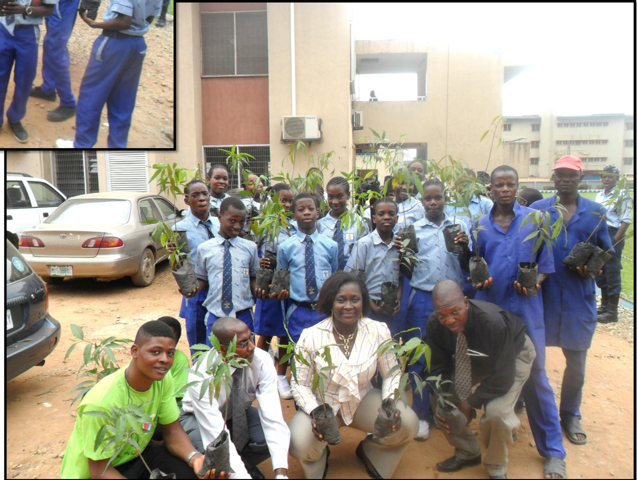
PICTURE OF ENVIRONMENT AMBASSADOR, TEACHERS & ENVIRONMENT CLUB OF RONIK COMPREHENSIVE COLLEGE, EJIGBO, LAGOS.