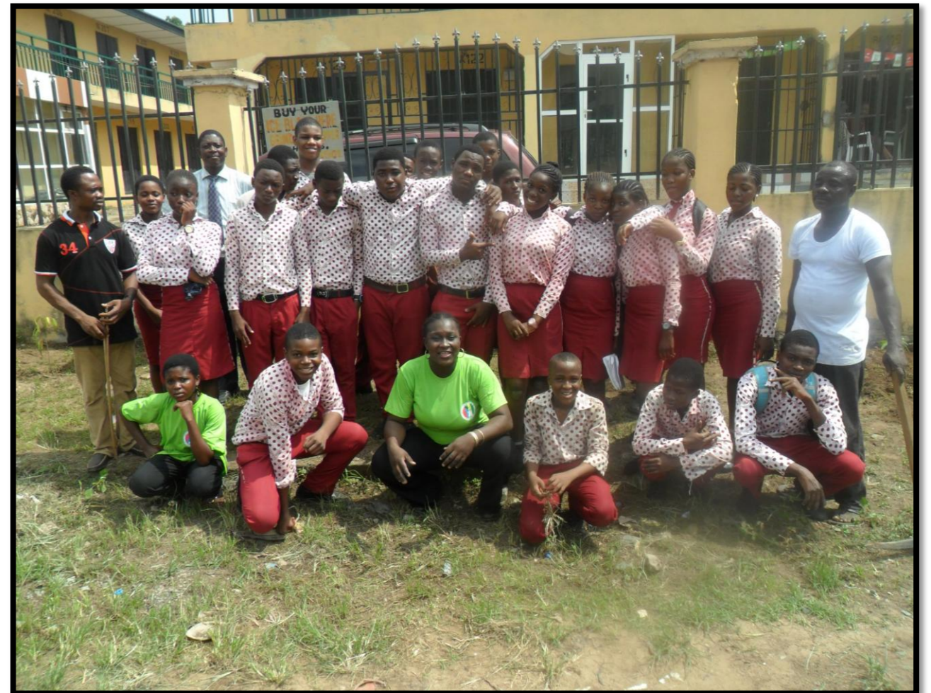
STUDENTS TAKE PICTURE WITH ENVIRONMENT AMBASSADOR AFTER TREE PLANTING EXERCISE.