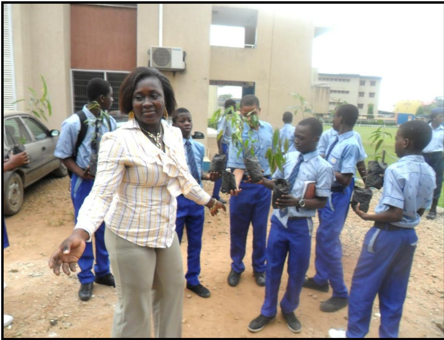
ARRIVAL AT THE SCHOOL, TREE SEEDLINGS GIVEN TO ENVIRONMENT CLUB OF RONIK COMPREHENSIVE COLLEGE, EJIGBO, LAGOS.