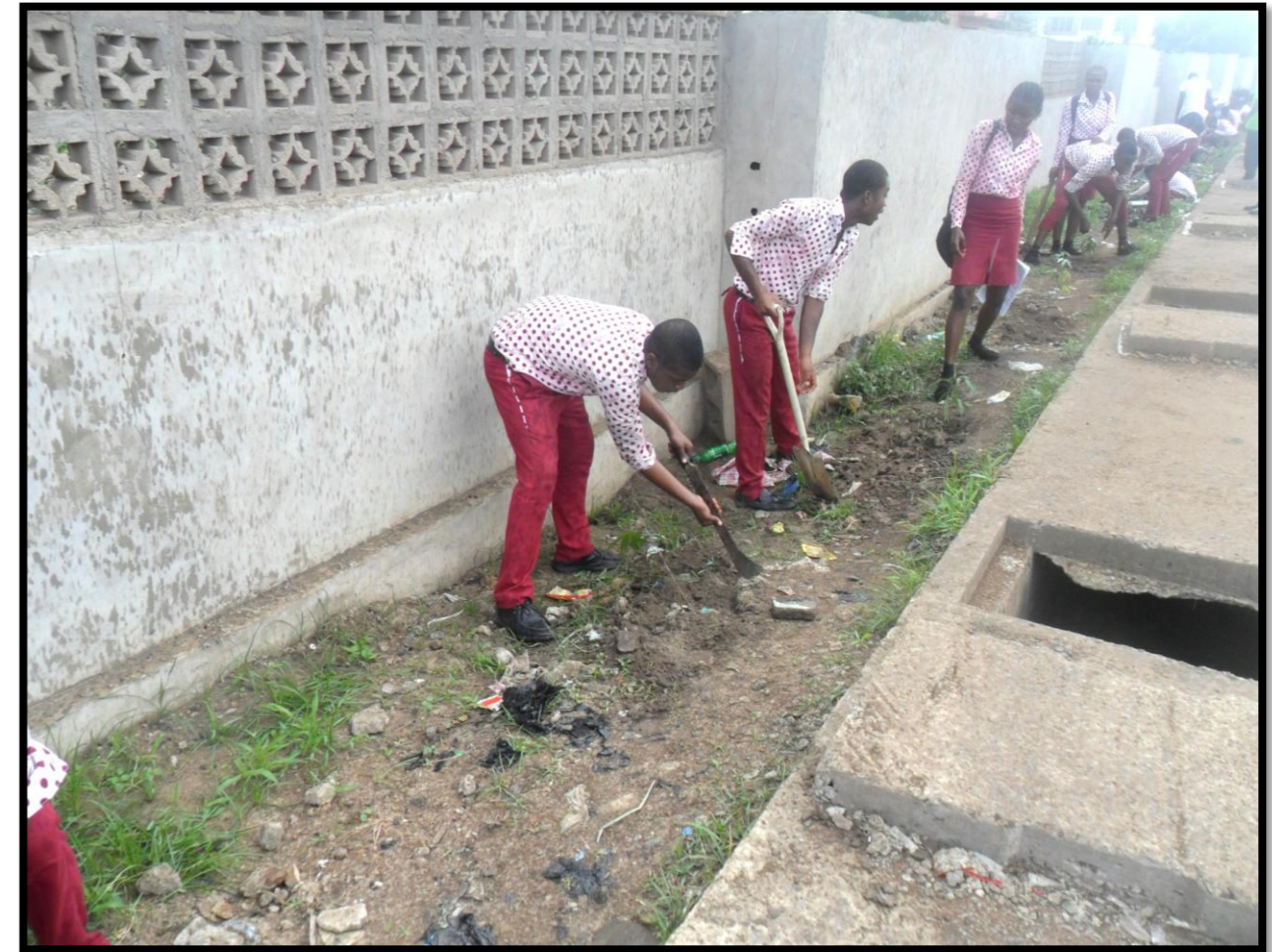
STUDENTS PLANTING TREES.