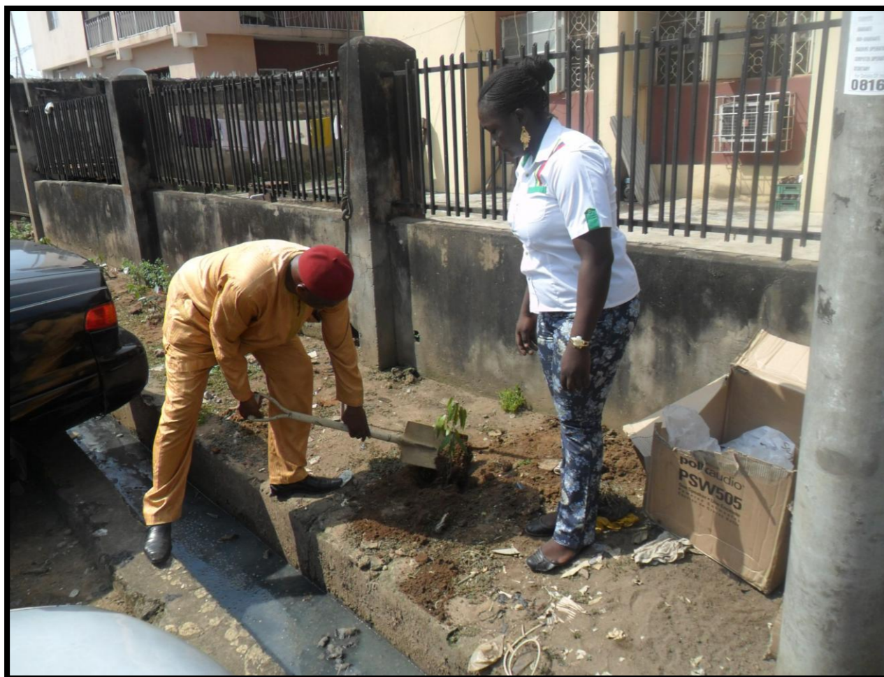
C.D.A CHAIRMAN PLANTS A TREE