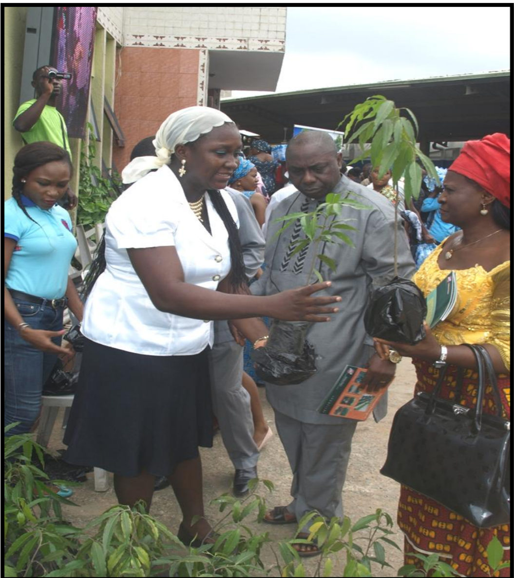
CONGREGANTS BEING EDUCATED ON HOW TO PLANT THEIR TREES AS THEY PICK UP THEIR SEEDLINGS AFTER REGISTRATION.