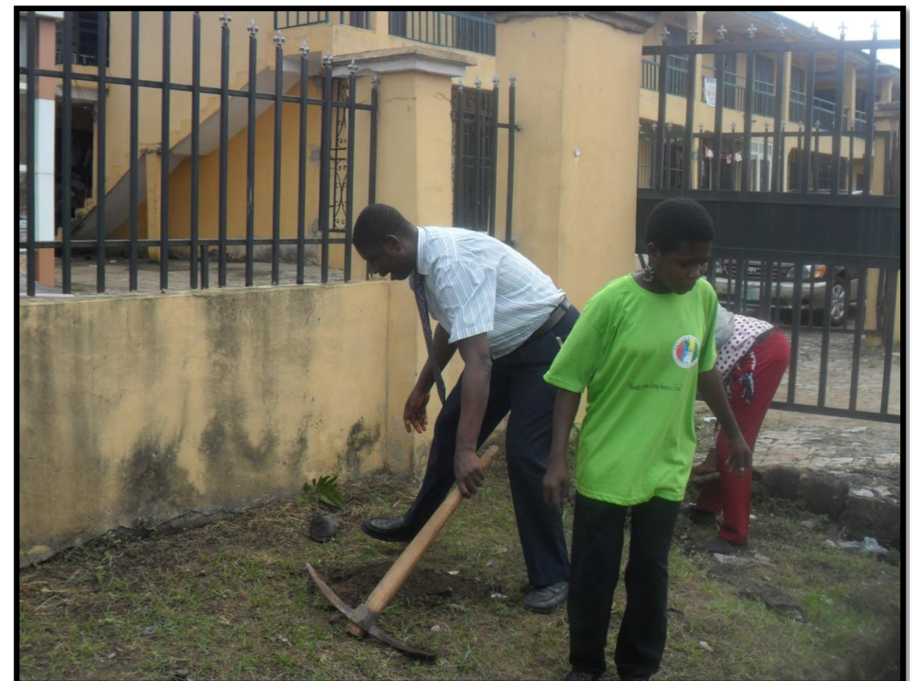
SCHOOL PRINCIPAL PLANTING A TREE.