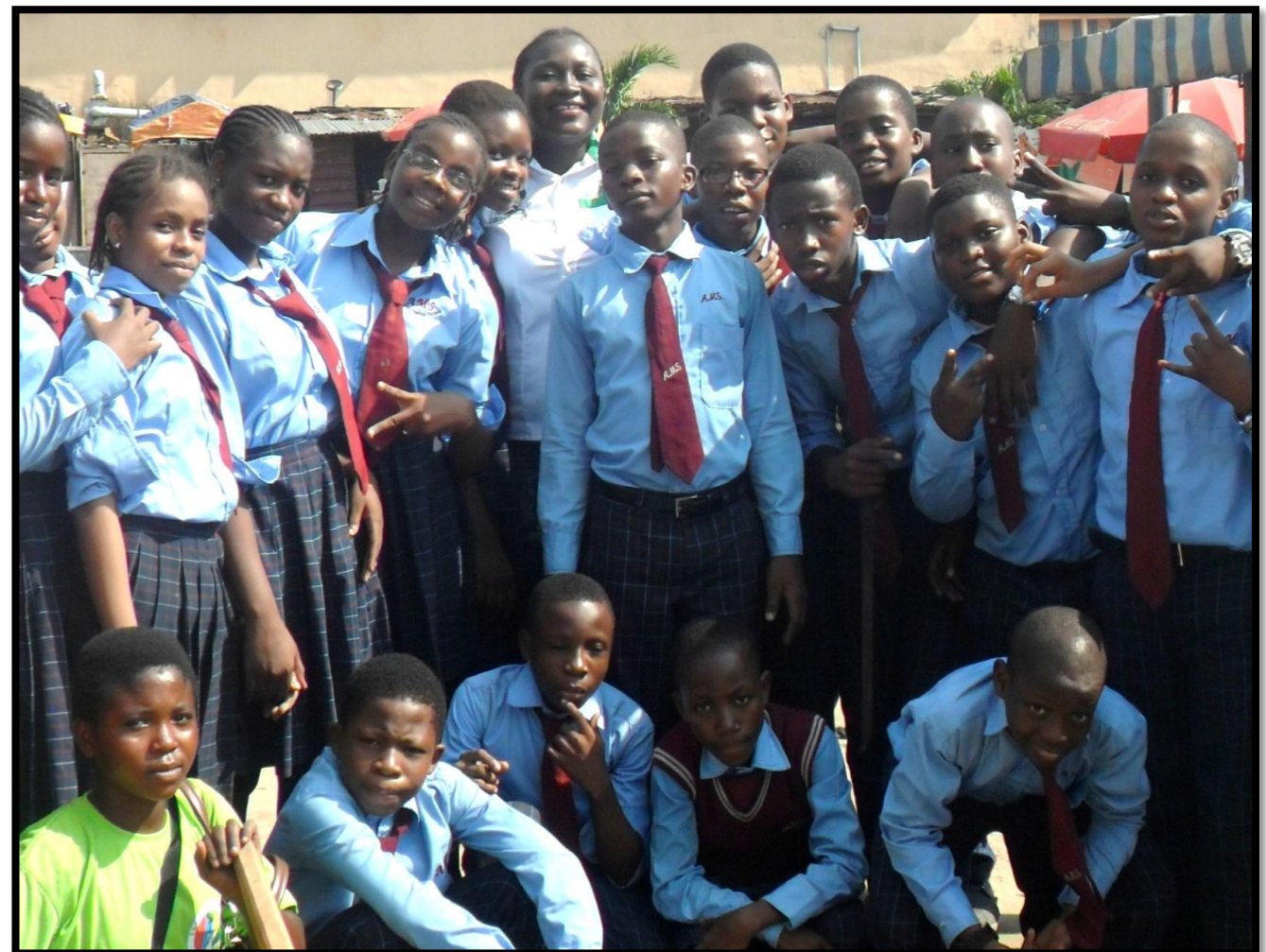
STUDENTS TAKE PICTURE WITH ENVIRONMENT AMBASSADOR AFTER TREE PLANTING EXERCISE.