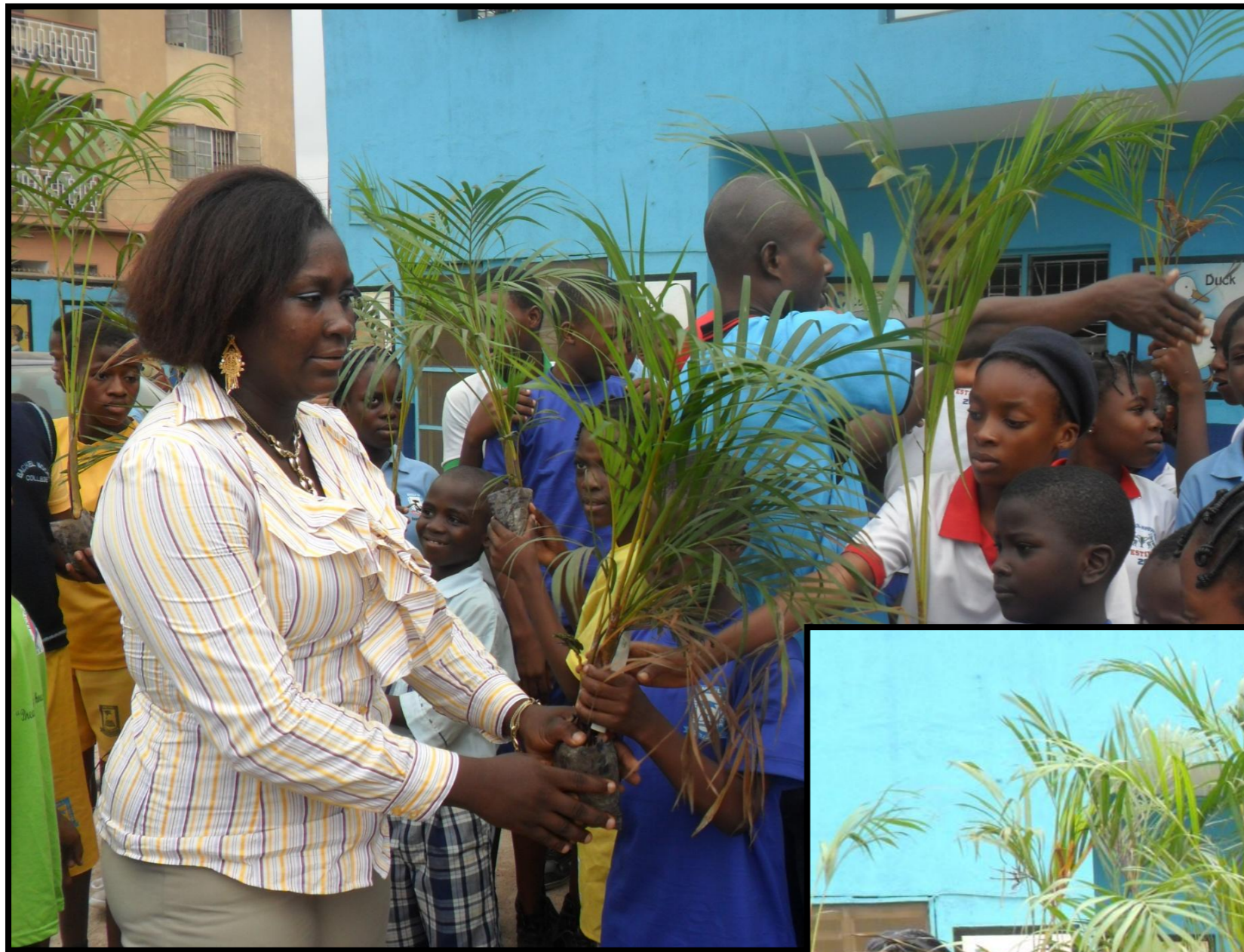
ARRIVAL AT THE SCHOOL, TREE SEEDLINGS GIVEN TO ENVIRONMENT CLUB OF BACHEL ACADEMY, CELE-EGBE, LAGOS.