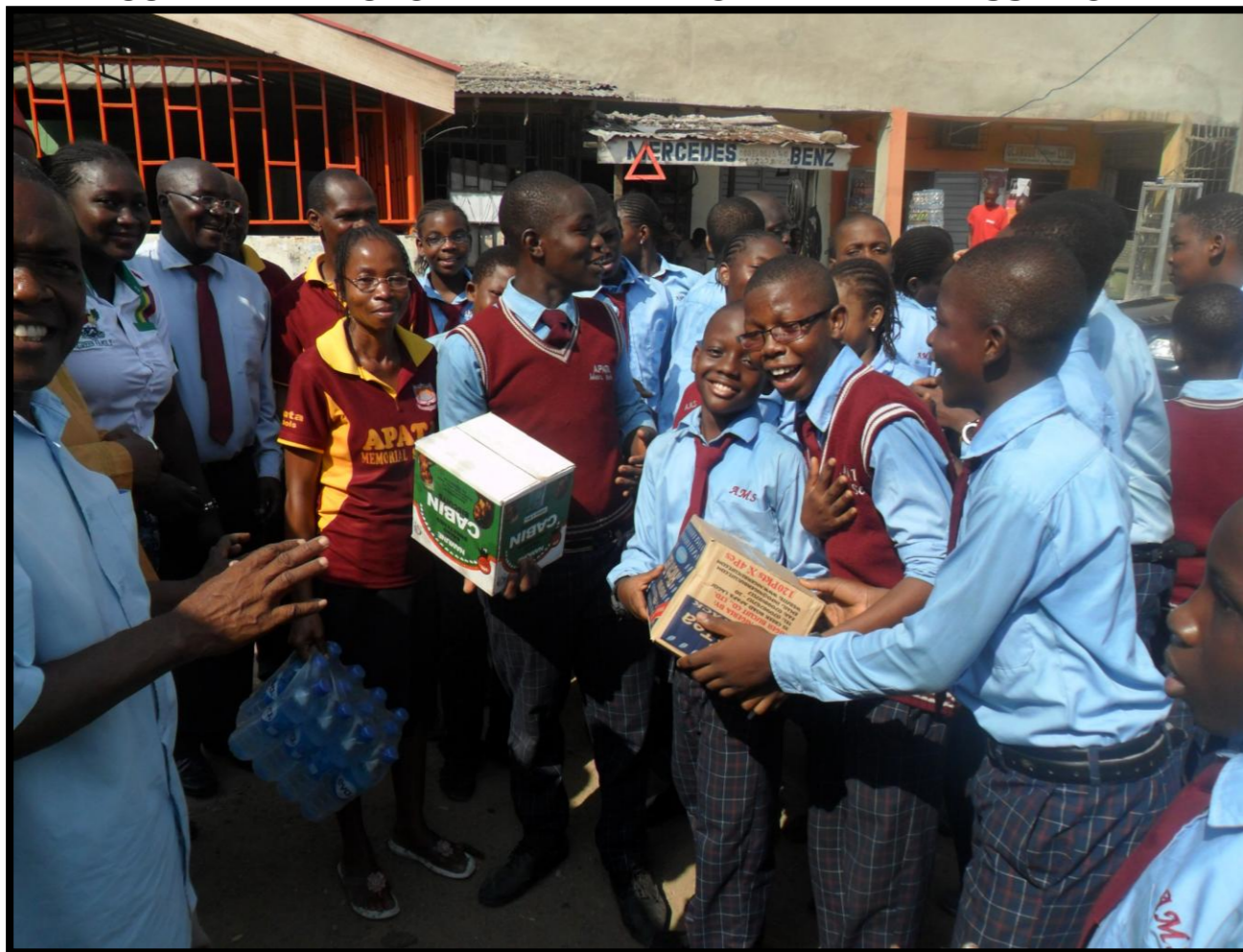
C.D.A EXECUTIVES PRESENT GIFTS TO STUDENTS.