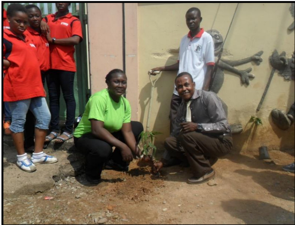
PRINCIPAL PLANTS A TREE ALONGSIDE ENVIRONMENT AMBASSADOR.