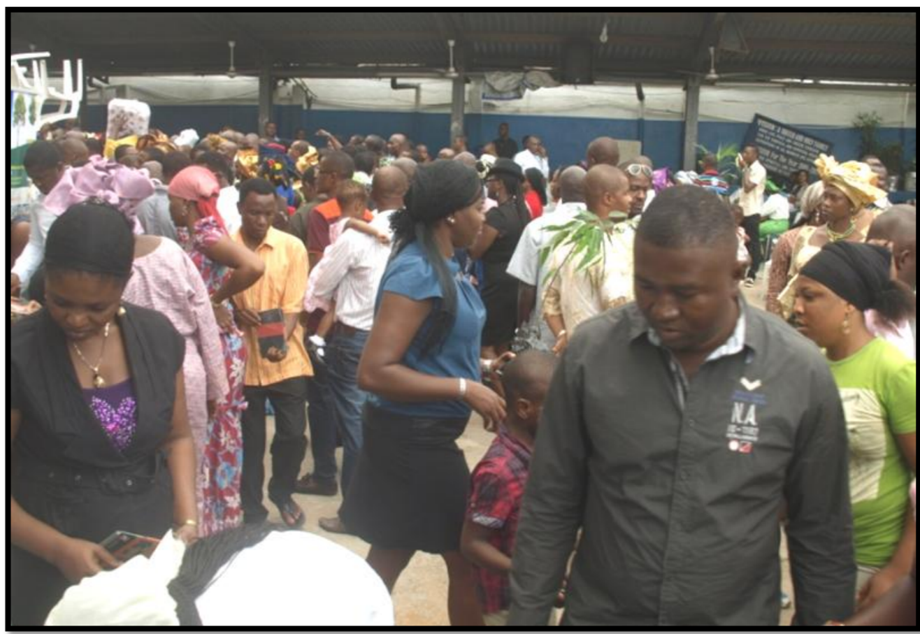
CONGREGANTS REGISTER AND PICK UP THEIR SEEDLINGS IN THEIR THOUSANDS.